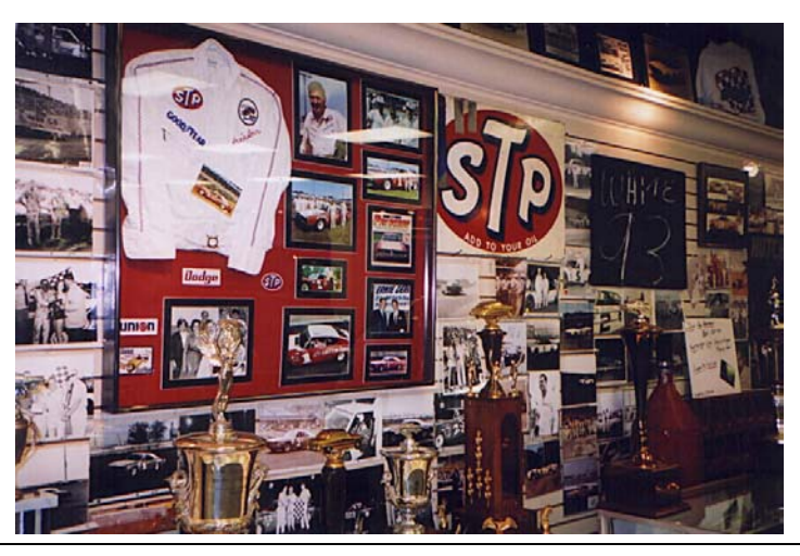
Right: Ernie Derr items displayed on the wall.