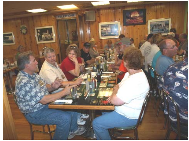
Wednesday evening we were the dinner guests of the White Rose Café in downtown Union Missouri. The White Rose has been operating continuously at the same location for over sixty years featuring lots of home made delights. The aero cars lined both sides of Main Street and were quite a sight.