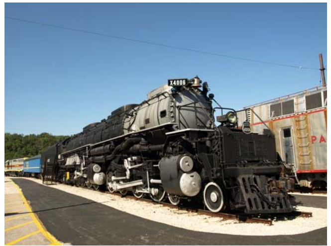
The 1955 General Motors designed Aero Train is one of only three built. It was unsuccessful overall, but what a great looking piece. At right is the 1941 Alco "Big Boy" – the largest successful steam locomotive ever built. It is a 4-8-8-4 configuration and larger than the one in the Henry Ford Museum. A movie producer recently tried to make one of these operational and gave up after spending over a million dollars expense. The Big Boy with its 38 wheels, weighs in at a staggering 1.2 million pounds.