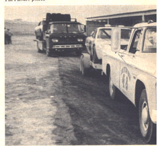
Pal Parker photo

The garage area PA crackled again, and a booming voice, unmistakably be-Pal Parker photo