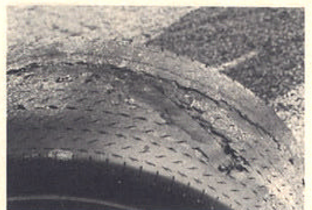
Above-These Goodyear tires came off of cars that ran in the Talladega 500.

tingency award. As it was he may have thrown away the $40,000 season's contingency money he has already earned. That is an example of the strong feelings these drivers had about the Talladega